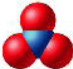
Nitrate ion ( \text{NO}_3^- )