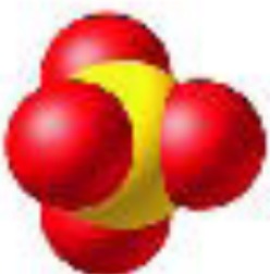
Sulfate ion ( \text{SO}_4^{2-} )