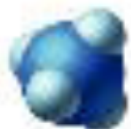
Ammonium ion ( \text{NH}_4^+ )