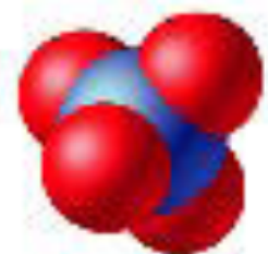
Phosphate ion ( \text{PO}_4^{3-} )